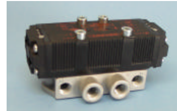
AE-1009 AE-1010 AE-1120 AE-1121

All solenoid valves are supplied less coils & connectors. See below for coil & connector information.